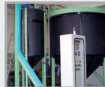
Die cleaning plants with related caustic soda recovery