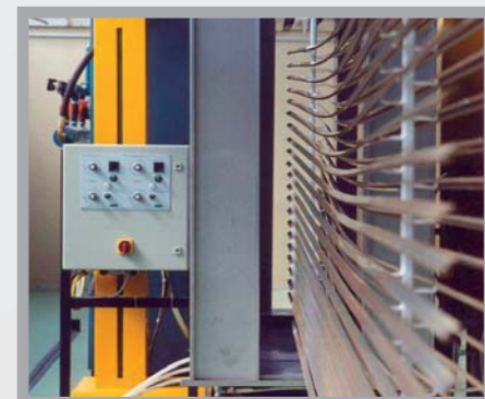
Modern automatic horizontal plant