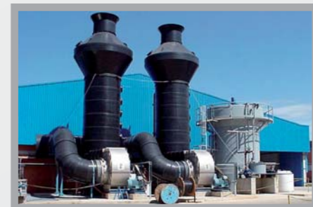
Fumes scrubbing plant (Alcoa)