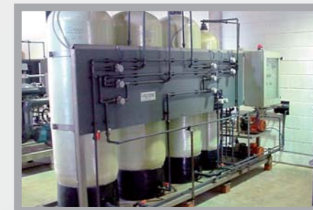
Freeal, sulphuric acid recovery plant for anodizing solutions