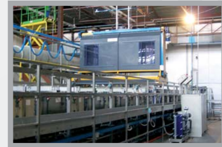
Bridge crane with complete suction hood for brightening line