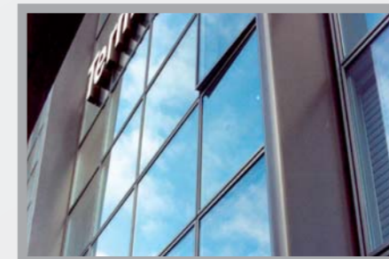
Copenhagen airport gray multicolour