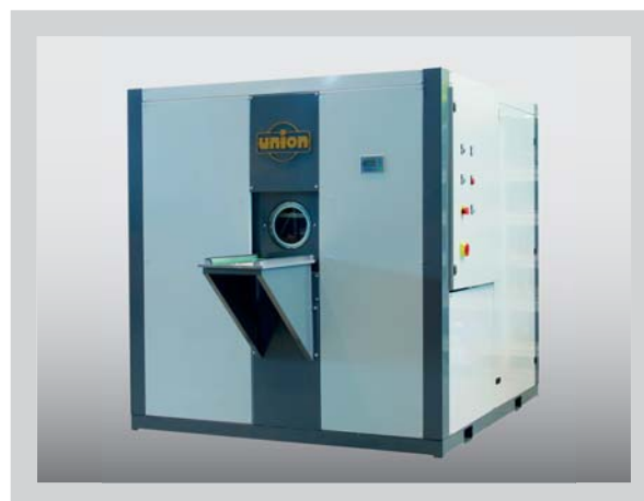
Hydrokinetic vacuum cleaning machine