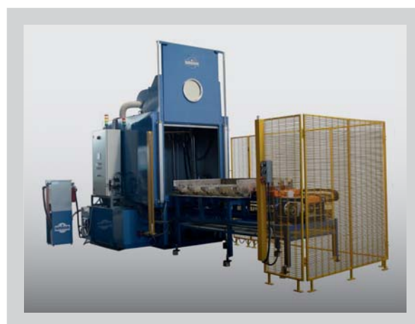
Degreasing cabin front loading spray cleaning machine